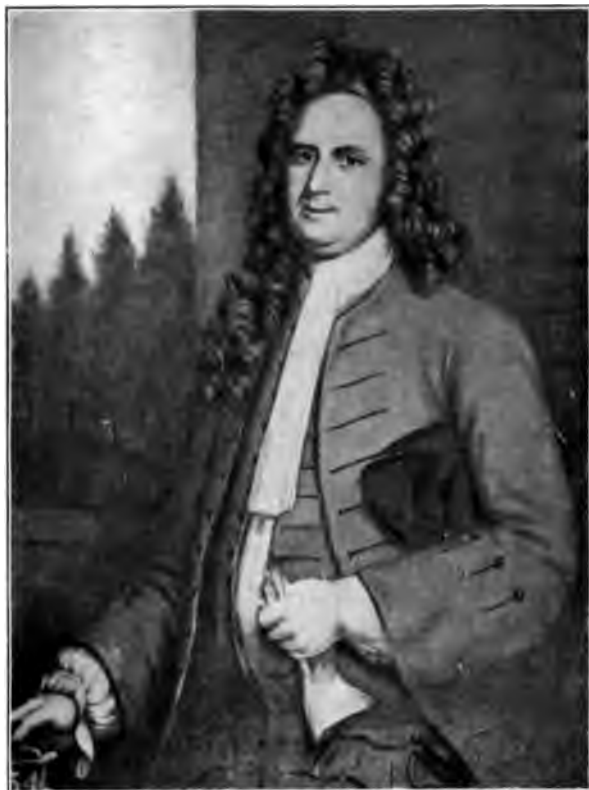
GOV. WILLIAM CODDINGTON, JR. 1683-1685